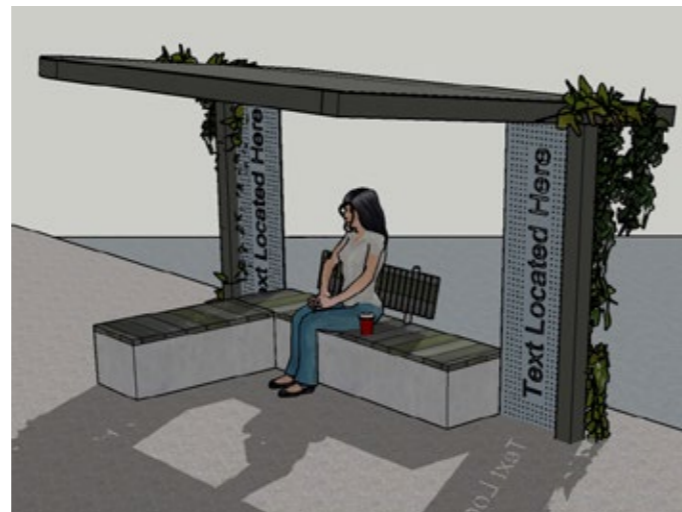
Artists impression: New canopy seating structures for William Street stage 2 works

Keep up to date at pscouncil.info/ sturgeon-st-raymond-terrace