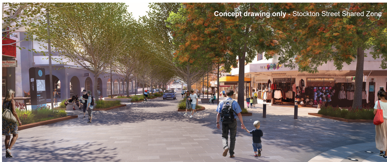
Concept drawing only - Stockton Street Shared Zone