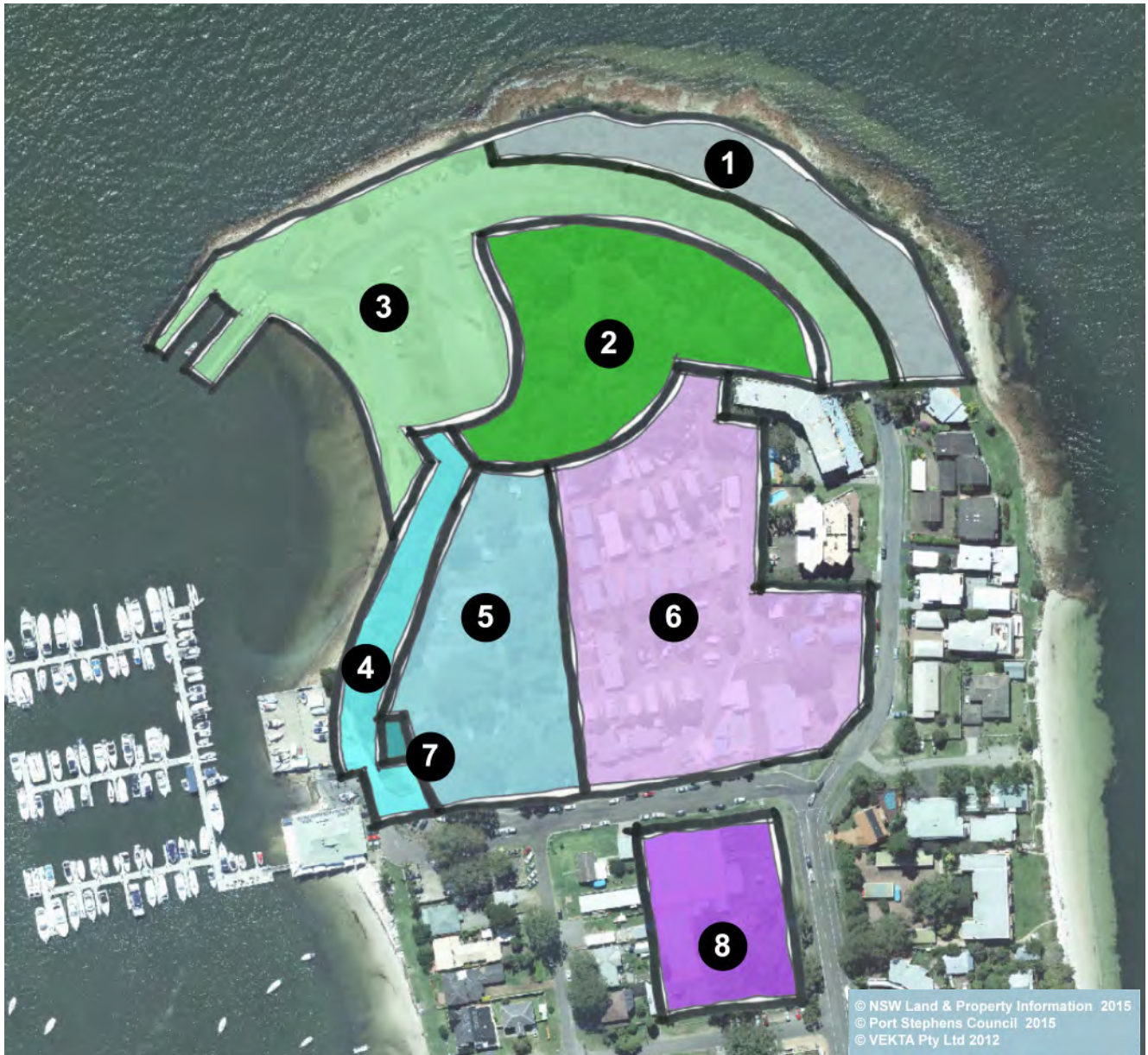
Figure 5: Management Focus Areas

© NSW Land & Property Information 2015 © Port Stephens Council 2015 © VEKTA Pty Ltd 2012